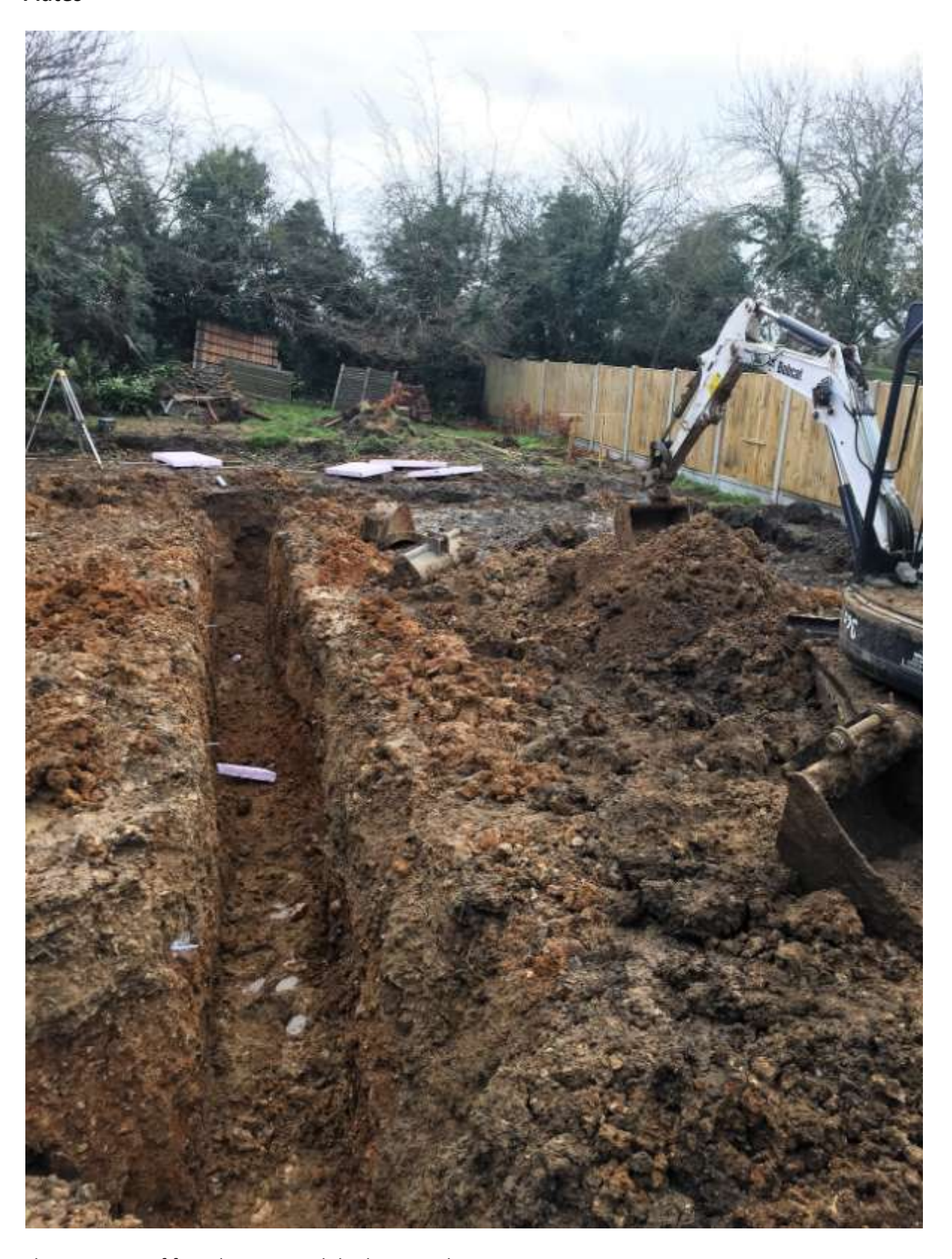
Plate 2. View of foundation trench looking south-east