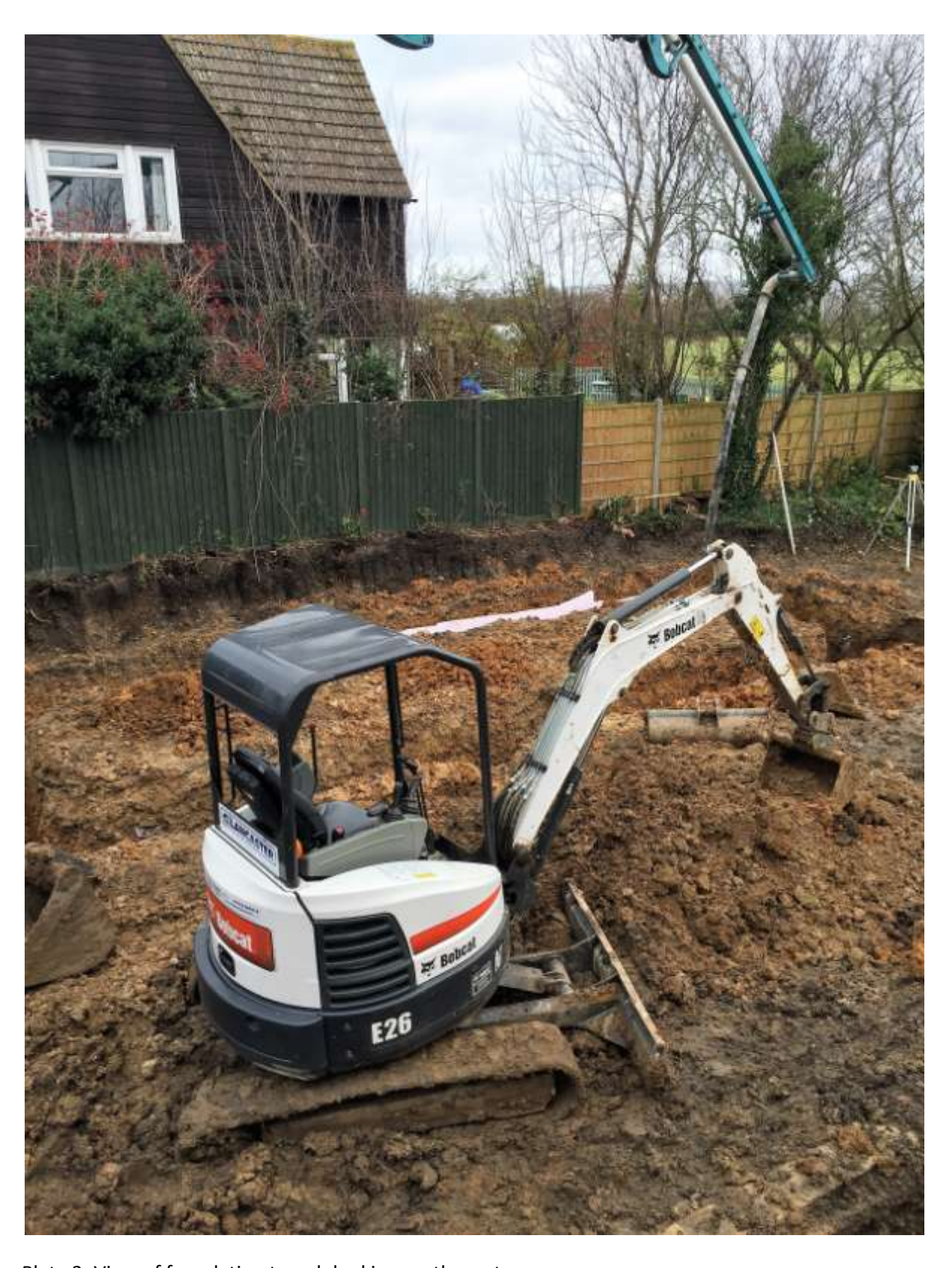
Plate 3. View of foundation trench looking north-west