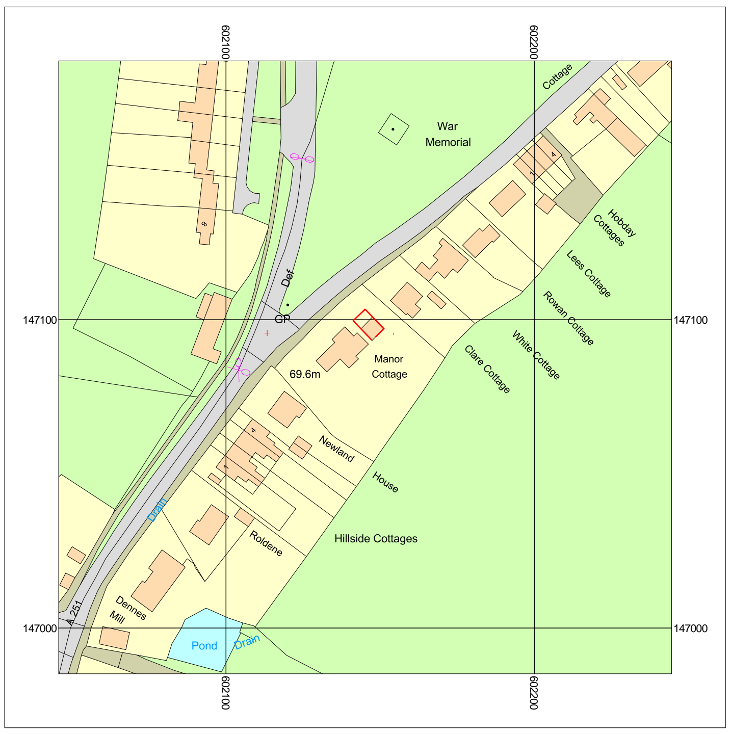
Figure 1. Area watched in red