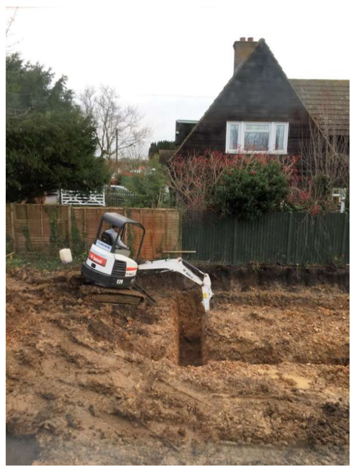
Plate 4. The site showing cutting of foundation trenches on the north-east side