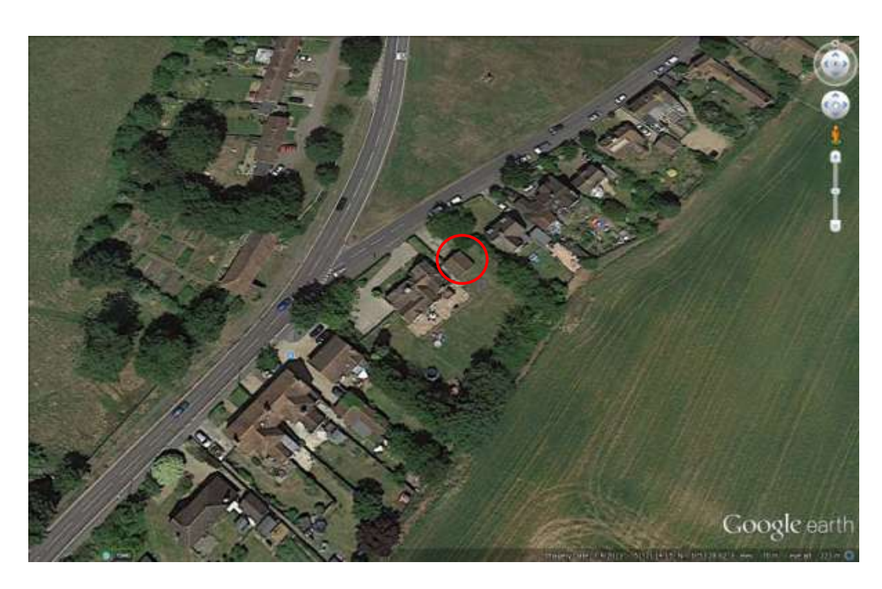
Plate 1. Aerial view of site (red circle) showing the site prior to development.